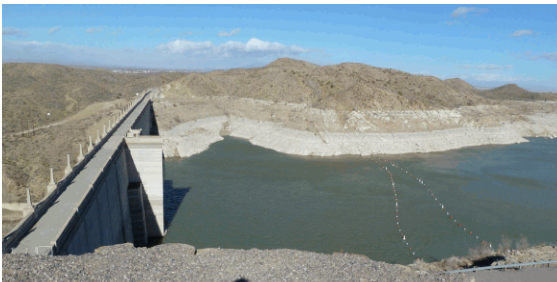
Elephant Butte Dam, 2013