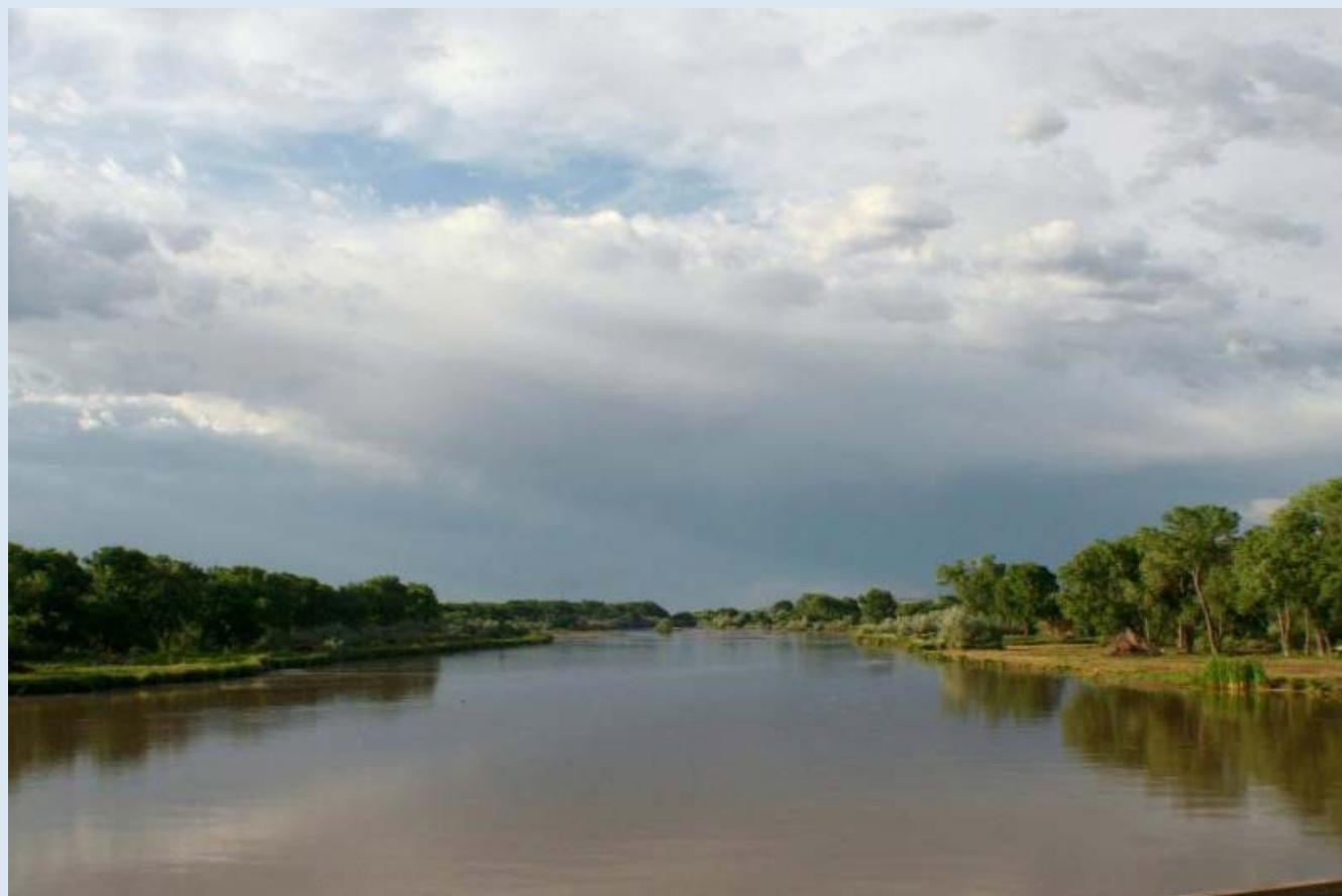
Rio Grande in spring runoff