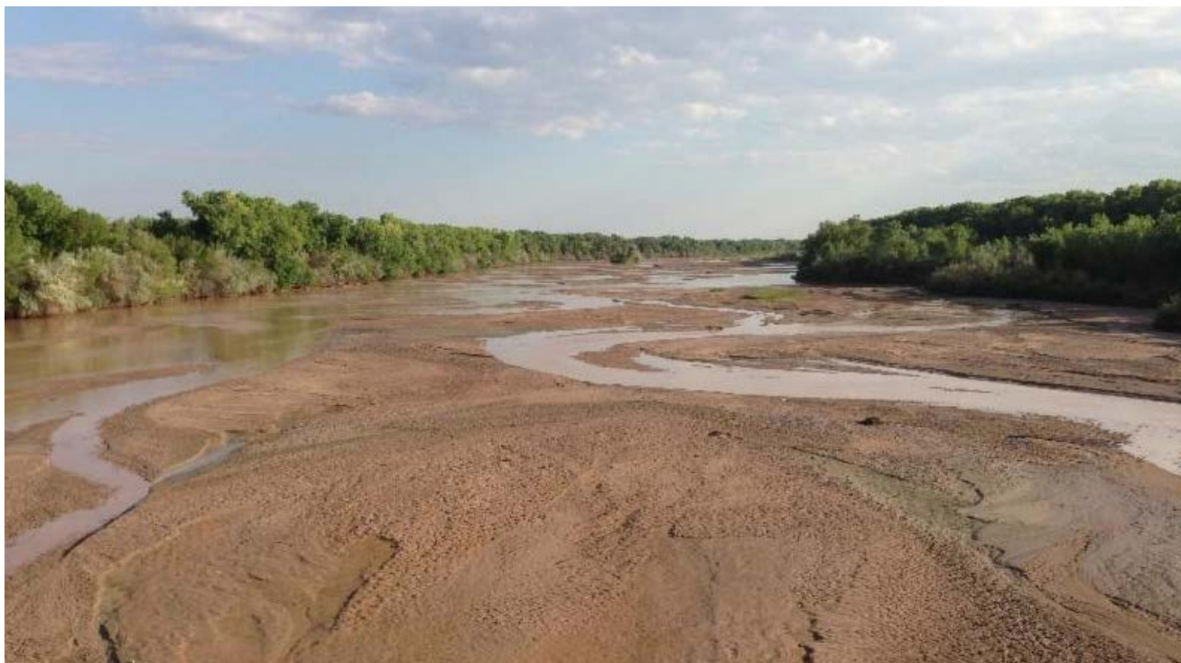
Middle Rio Grande, August 2013