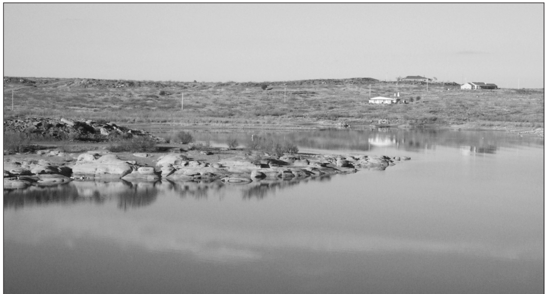
Ute Reservoir on the Canadian River

State: At the state level, the New Mexico legislature has provided Project money in each year from 2006 to the present. In 2006, $1.25 million was appropriated. In 2007, then Governor Richardson’s “Year of Water” initiatives included $5 million for the Project, of which only $1 million was directly appropriated. As expected, however, the legislature also approved a $2.3 million capital outlay request for the project through the N.M. Water Trust Board (Board). In 2008, the legislature approved $4.5 million,